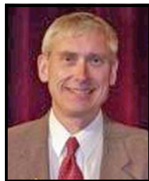
State Superintendent of Schools—Tony Evers