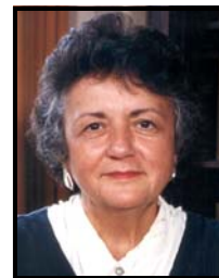
Supreme Court Justice—Shirley Abrahamson